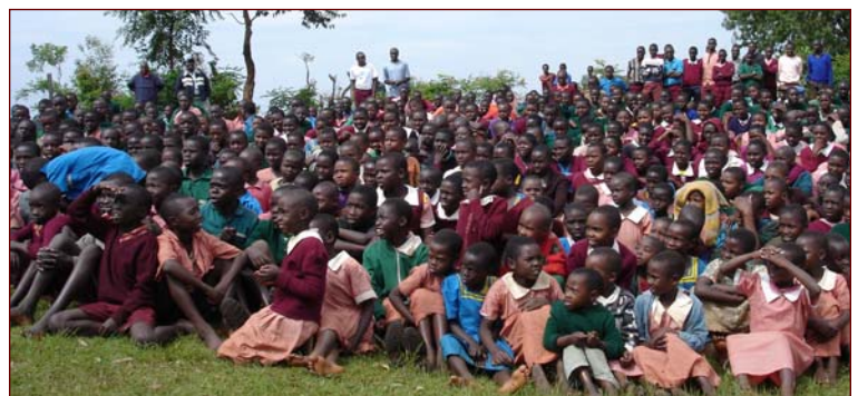
Community gathering to watch LHM - Kenya performers