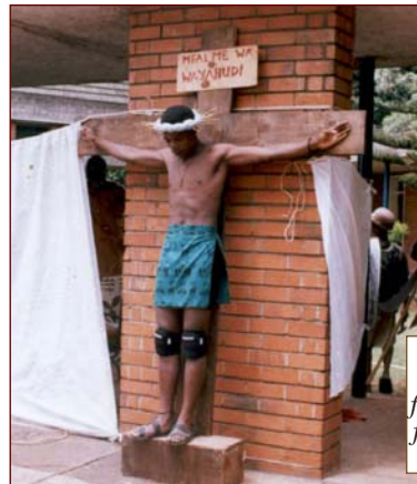
A scene from LHM - Kenya's public performance of the crucifixion of Jesus Christ.